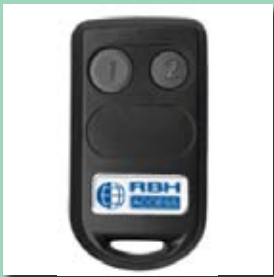
TR-2 Two button transmitter