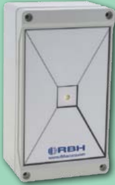
RBH-FR-4000 Receiver (IP66 compliant plastic enclosure)