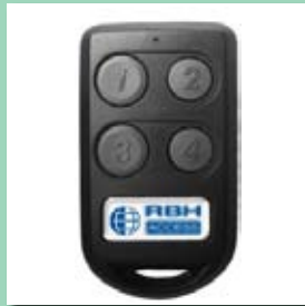
TR-4 Four button transmitter